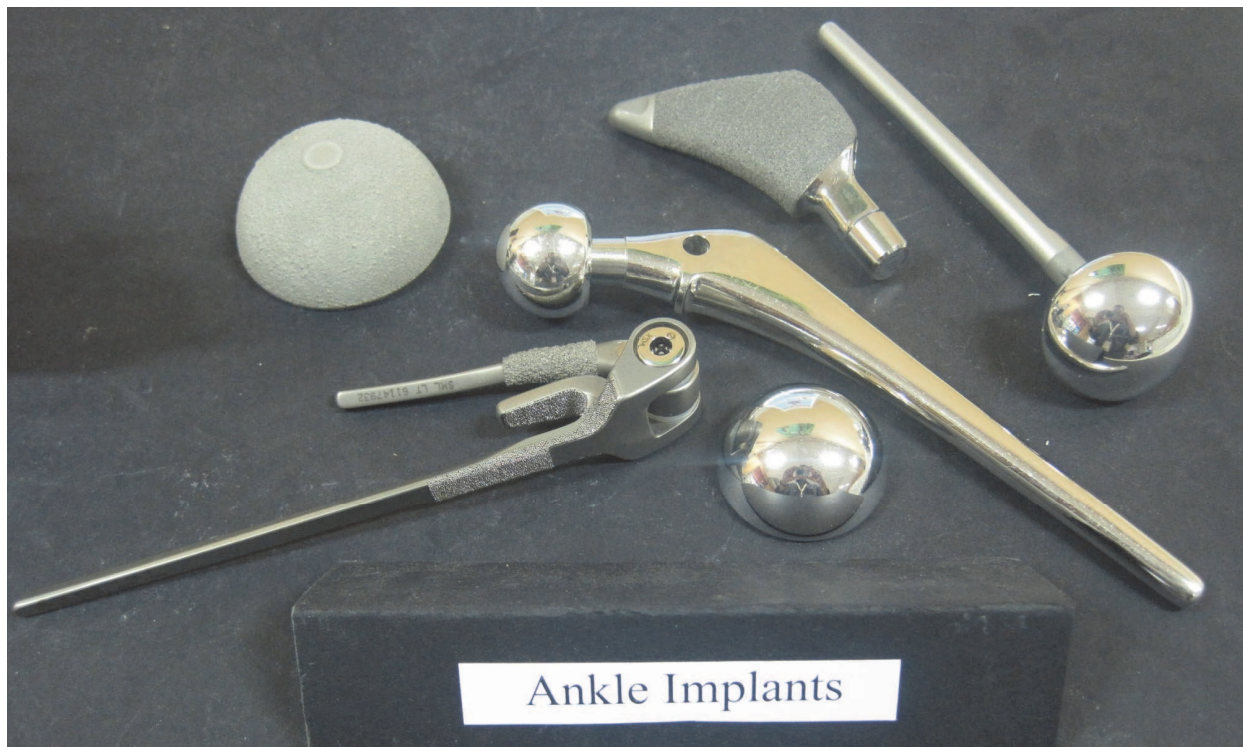
Fig. 1. A set of ankle implants (Courtesy of MediTeg, UTM).