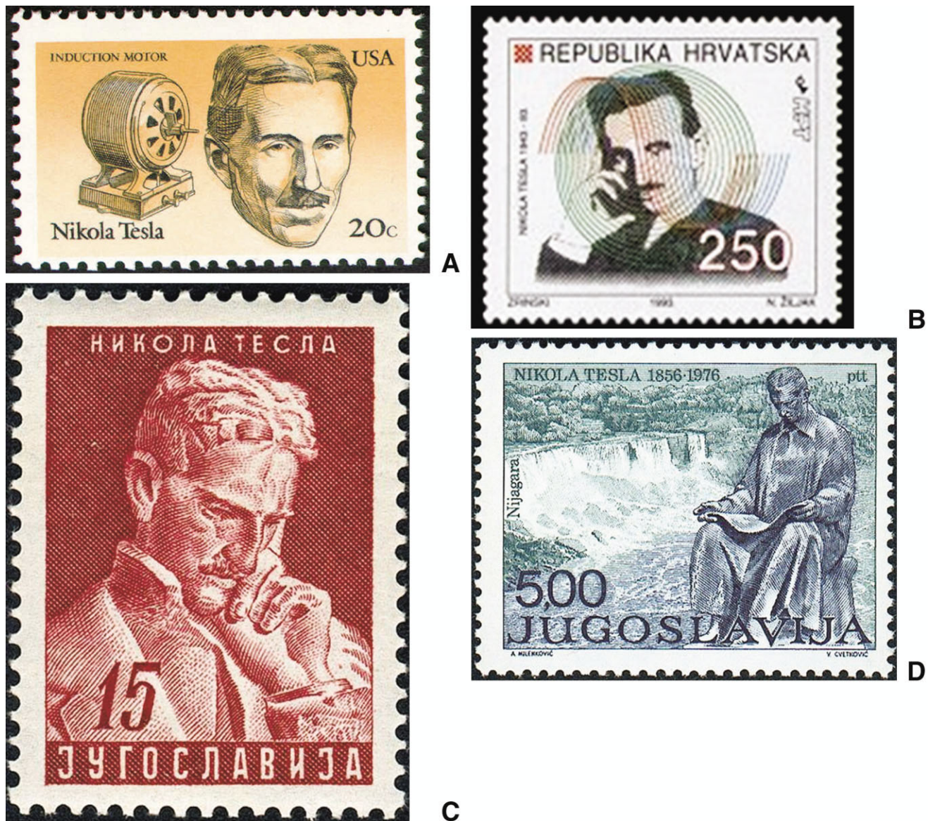
Figure 2. Tesla stamps. A: The Nikola Tesla postage stamp, United States, 1983. B: Commemorative Croatian Postage Stamp, 50th anniversary of the death of Nikola Tesla, 1993. C: Yugoslavia, 1953. D: Yugoslavia, 1976.

not the opportunity he had hoped for, the group was willing to finance the Tesla Electric Light Company. The proud new owner set to work and invented a unique arc lamp of beautiful design and efficiency. Unfortunately, all of the money earned went to the investors, and all Tesla got was a stack of worthless stock certificates.