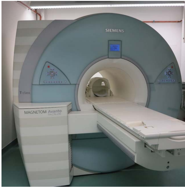
Figure 1. Realistic mock scanner with head coil.

Commission on Non-Ionizing Radiation Protection (16), and the World Health Organization (17).