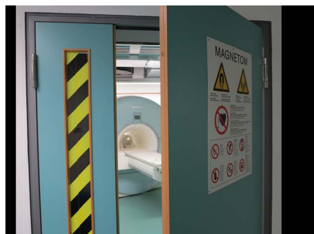
Figure 2. Door of the room of the mock scanner with safety advice.

After each procedure the subjects were asked to fill out a "yes-or-no" questionnaire of 20 questions in total regarding potential sensory perceptions while undergoing the procedure, whereof 14 questions provided the opportunity of additional gradual scaling on a 10-point scale if positive.